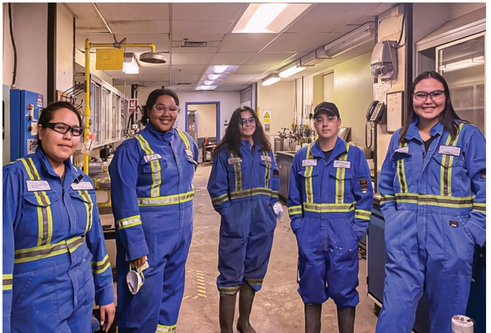
Interns meet at the Metallurgical lab to put on the proper personal protective equipment (PPE) for the water treatment and mill tour during the workshop.

The Intern Workshop was a victory for all the 2022 interns and will hopefully become a new tradition at Red Dog for the years to come. ■