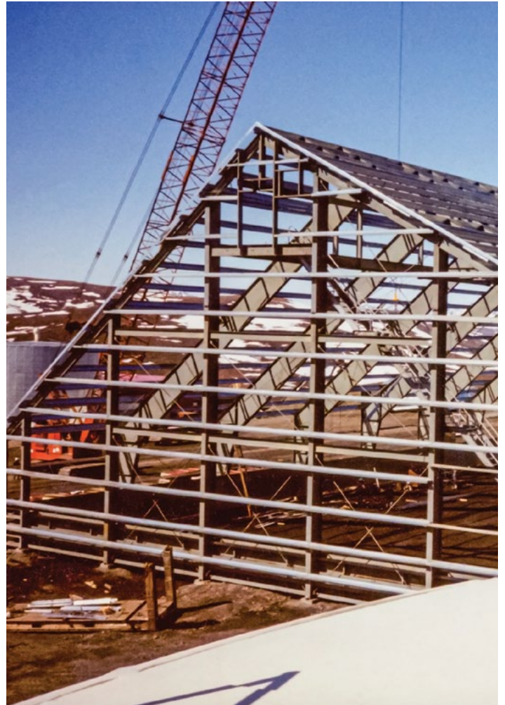
Foundations for a brighter future: construction of the port facility in 1988.