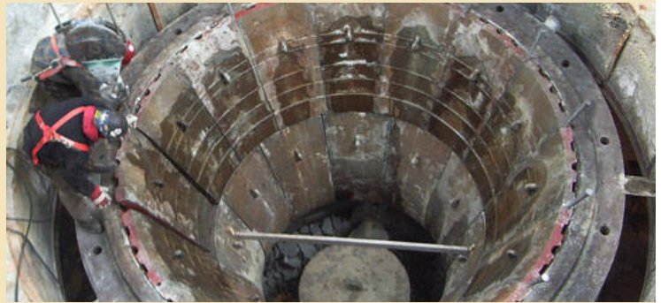
Crusher Re-Line in Progress.

This safety idea came from the entire crusher crew and was fabricated by Curt Wladyka and Jeremy Jenson. There are no toe boards needed in the ring. There is a natural toe board already built into the crusher bowl. Mid-rails are being installed within the handrail to further increase safety.