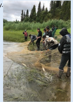
Hauling in the fish.

They responded: boating, seining, fish scaling and cleaning, native Olympic games, braiding yarn strings for hats, mukluks, mittens and gathering and chopping firewood. We discussed how to do each task safely.