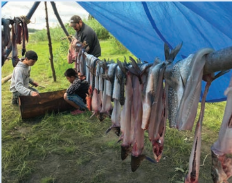
Hanging and smudging fish on the rack

Before departing for the day, we sat around the campfire stove and shared stories and played games. The time spent was a great refresher of culture and community and of the benefits that Red Dog provides for our region.