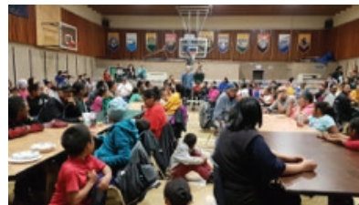
Noorvik youth fill their plates during the annual Back to School Potluck on September 12.

Paġlagipsigiñ (we welcome you) to the new incoming teachers and staff!