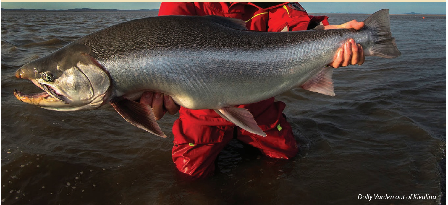
Dolly Varden out of Kivalina