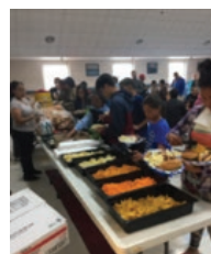
Kivalina community kicks off the school year together.