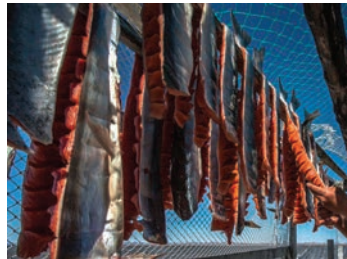
Drying Dolly Varden in Kivalina

Between 2003 to 2017, the average mercury concentration in muscle tissue from Dolly Varden from the Wulik River was about 0.02 milligrams per kilogram (mg/kg) of fish muscle tissue. In 2017, the average mercury level was about 0.009 mg/kg. By comparison, FDA reported average mercury levels tested in commercial fish in the United States between 2002 and 2012: