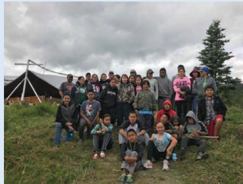
Campers gathered for group photo