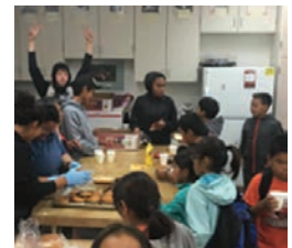
Buckland had an excellent turnout for their potluck on September 16. Taikuu (thank you) to everyone that volunteered!