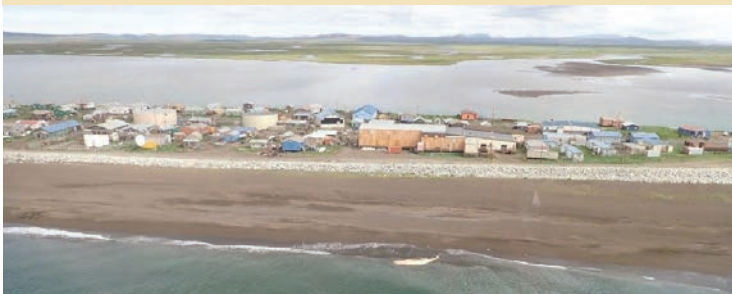
Kivalina's beach with the nearly 30-foot long beached whale.

I was thankful for the opportunity to help, and looking back, better understand the dynamics of the Environmental and Community Relations merger and how it makes unplanned tasks like this easier. I look forward to what the future holds with regard to adventurous, but well planned, non-routine tasks.