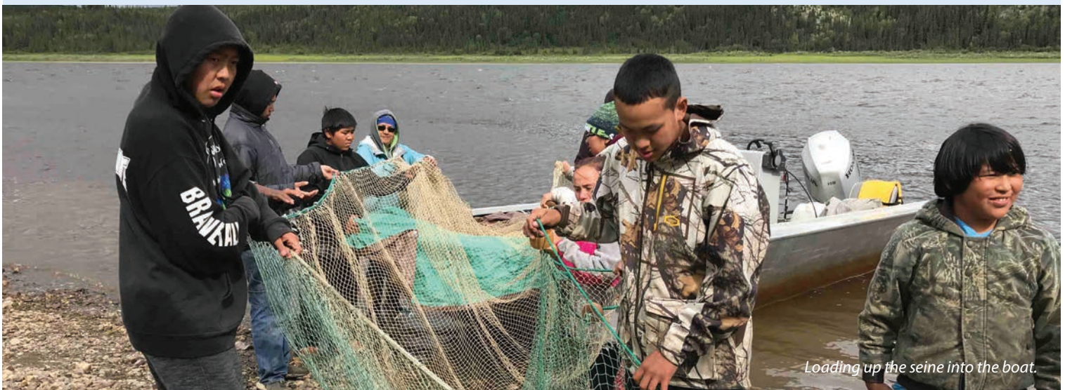
Loading up the seine into the boat.